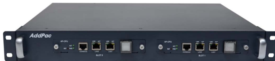
IPNext500 IP-PBX System